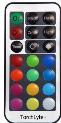
TorchLyte™ Full Remote